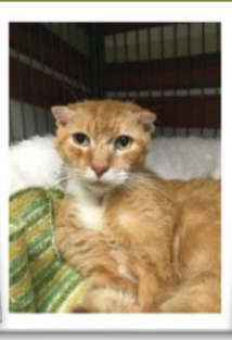
Scotty, age 12