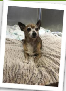
Peanut, age 10

People often overlook senior pets because, let's face it, none of us want to get attached to a pet that may not have many years with us. While saying goodbye is the toughest part of loving any pet, the seniors who come into our care have typically been owned and loved for much of their lives and the shelter setting can be quite stressful, so we try to find them homes quickly. Plus, there are many benefits to adopting a senior pet! House training and basic commands are already learned, older pets are typically calmer, and seniors are usually ready to be instant companions who will love you unconditionally. Do you have room in your heart for a senior pet?