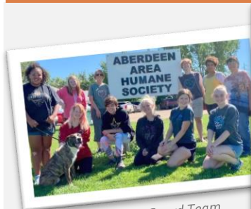
CHS Color Guard Team