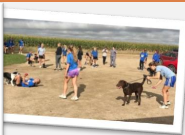
CHS Soccer Team

We’ve been lucky to have several local high school and university teams help in a variety of different ways over the last few months! The Aberdeen Central soccer team came out to the shelter and cleaned cat rooms and ran dogs, AFTER their own practice! The Northern State University track and cross-country team spent an entire morning helping price and put away donated items for the Fall 2 nd Paw Sale. Finally, the Aberdeen Central Color Guard team helped us pull weeds, tidy up our food room, do dishes, socialize cats and walk dogs! If your group is interested in putting in some much-appreciated volunteer hours, please contact us!