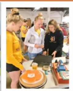
NSU Track & Cross-Country