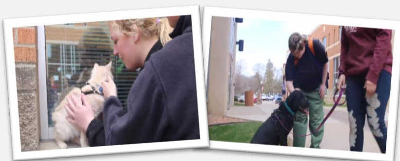
Shelter Pets Ivan and Bear Greeting NSU Students

Studies show that interactions with animals can decrease stress in humans. Petting an animal can increase levels of the stress-reducing hormone oxytocin and decrease production of the stress hormone cortisol. That's why we partnered with Northern State University during finals week in April. All the studying and test taking can be stressful and having shelter cat Ivan and shelter dog Bear present on campus helped students take a quick stress relief break before moving on to the next test. We are not only helping animals, but helping the community too!