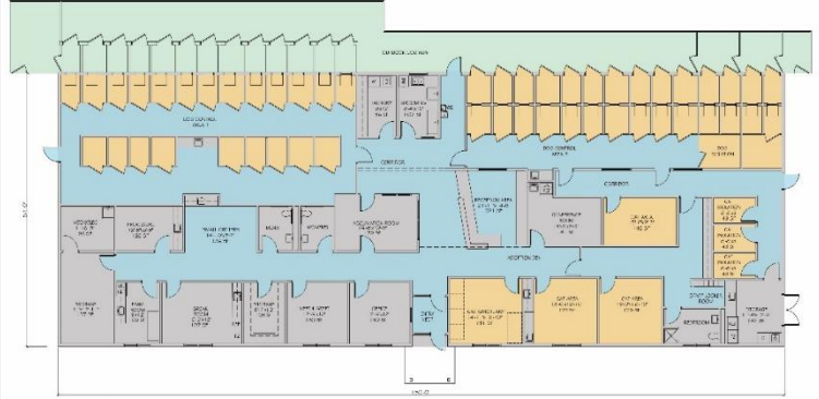
FLOORPLAN NO SCALE: 7,350 S.F.