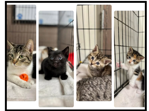
Mama Walker and her kittens Westlyn, Waverly, and Wylder!

If you are interested in learning more about fostering you can visit with our shelter staff and they will answer all your questions and concerns.